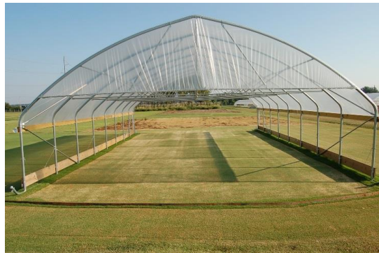
Rainout shelters are already installed at three locations (see map)