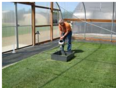
Plots are individually watered after they reach the desired drought stress threshold.